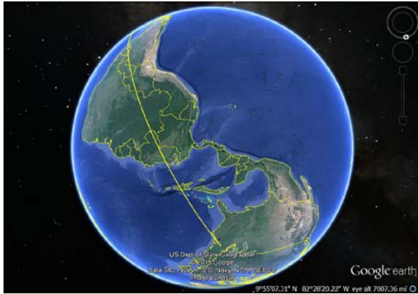
Figure 1) The red lines in the top map show trajectories of an ICBM from North Korea to the United States. Fort Greely in Alaska occupies a strategic location that can intercept missiles on these trajectories. The yellow line in the bottom two shows a trajectory a satellite can take, possibly delivering an EMP attack.