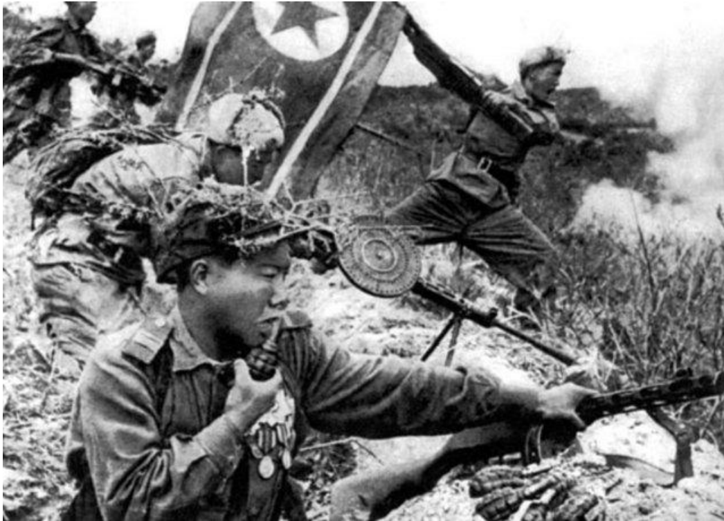
Figure 3: DPRK troops in action.